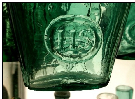
Figure 2 – HS logo (Corning Museum)

McKearin and Wilson (1978:591) illustrated the HS mark as well as “IP” and another re-cut mark of HP (actually “IP” with the bar that looks like “HP”), all on the same type of Masonic flask (Figure 3 – also see the next entry). They noted that Toulouse was the first to suggest the alteration from HS to HP (or IP) based on drawings in their first book (also see Toulouse 1971:252-253). They fully accepted his logic. Examples of the HS bottle were found in the May 1818 shipwreck of the Caesar . However, they dated the bottle as made in 1815 (McKearin & Wilson 1978:103, 438).