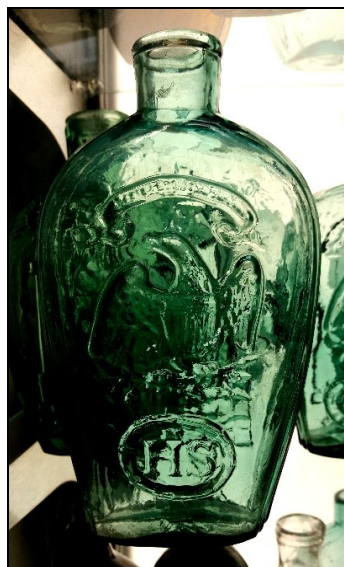
Figure 1 – HS flask (Corning Museum)

The HS mark was placed on Masonic flasks by Henry Schoolcraft between 1815 and 1817 (Figures 1 & 2). Schoolcraft made the flasks at the Keene Glass Works, Keene, New Hampshire, operated during 1815 and 1816 by Twitchell & Schoolcraft and in 1816 and 1817 by Schoolcraft & Sprague (Toulouse 1971:254-257). The mark was also noted by Knittle (1927:441).