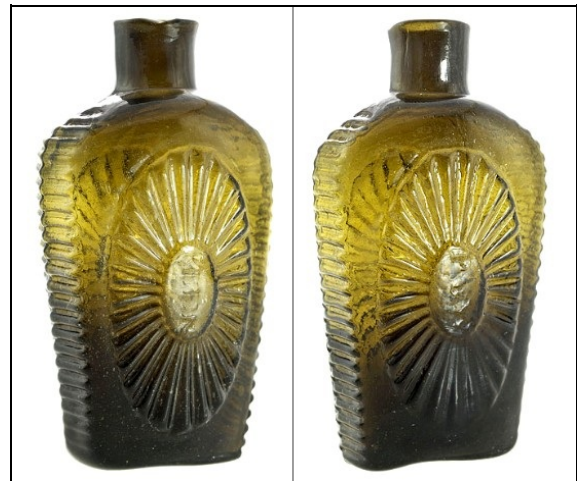
Figure 9 – Keen figural flask (Glass Works Auction)