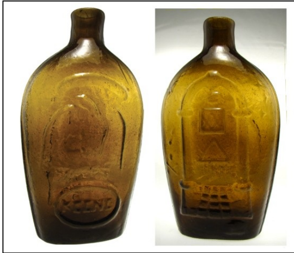
Figure 7 – Keene-Masonic flask