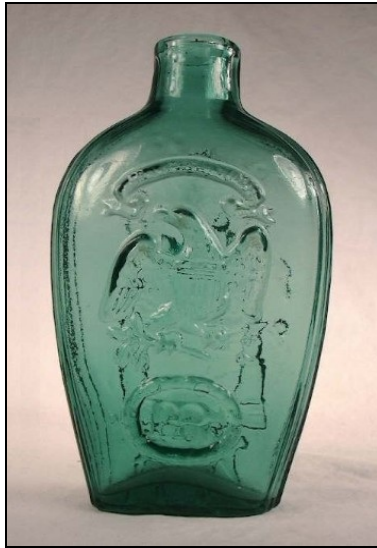
Figure 4 – IP flask (Lindsey 2016)