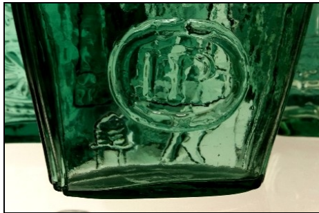
Figure 5 – IP logo