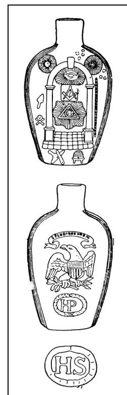
Figure 3 – HS flask (McKearin & Wilson 1978:591)